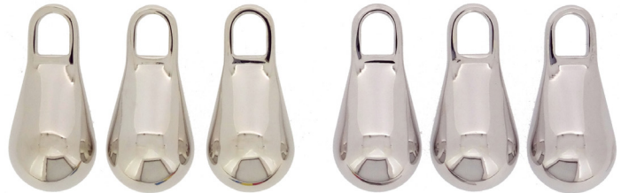
Standard White Bronze

clients evaluate it considerably whiter and more shining than both previous LEGOR formulations and other solutions they have tested in the market.